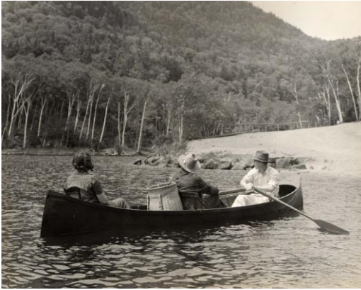
Rowing two people in a guideboat on Lower Ausable.